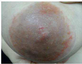
3. the affected nipple after 48 hours. We decided the pad was too small, so cut up another pad in a spiral shape to fit around the periphery.