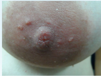
1. the unaffected nipple